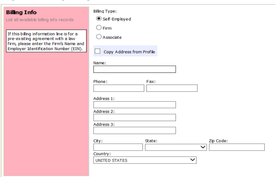
Figure 2: Profile Page-Billing Info section

You are required to periodically change your password.