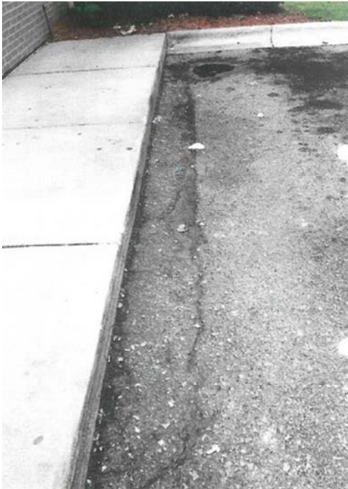
(ECF #16-5 at 7, Pg. ID 160)

In the parking spot nearest the sidewalk (“Spot #1”), there is a crack in the asphalt that runs parallel to the curb. (See ECF #16-5 at 7, Pg. ID 160.) The crack is approximately a quarter of an inch deep and runs approximately the full length of the curb. (See id. at 5, Pg. ID 158; see also Linda Grammer Dep. at 21, ECF #16-7 at 8, Pg. ID 175.) Spot #1 and the Crack appear in the photographs below: