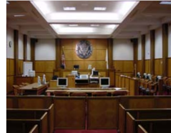
Shared Advanced Technology Courtroom

A high technology courtroom allows the judge, attorneys, jury, and spectators the ability to not only hear the testimony, but to see the evidence through electronic presentation.